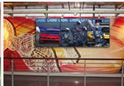
Cluster of 6