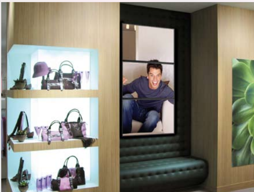
Vertical cluster of 3

A special sensor integrated in the front bezel continuously monitors the TFT panel's function (backlight, inverter, power supply and interface). Any malfunction is immediately detected and reported.