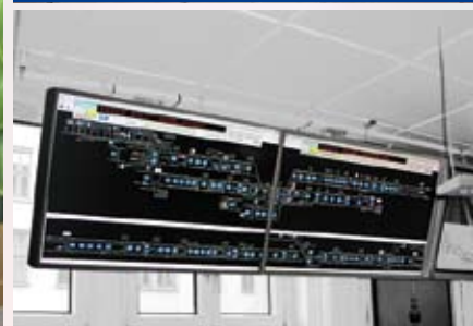
Horizontal cluster of 2